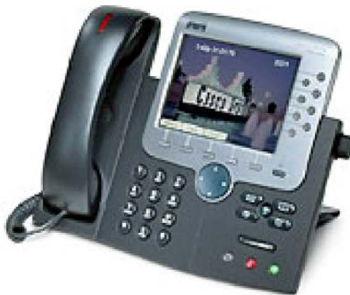
Figure 1. Cisco Unified IP Phone 7971G-GE

The Cisco Unified Communications system of voice and IP Communications products and applications helps organizations communicate more effectively—by helping them streamline business processes, reach the right resource the first time, and enhance productivity. The Cisco Unified Communications portfolio is an integral part of the Cisco Business Communications Solution—an integrated solution for organizations of all sizes that also includes network infrastructure, security, and network management products; wireless connectivity; and a lifecycle services approach, along with flexible deployment and outsourced management options, end-user and partner financing packages, and third-party communications applications.